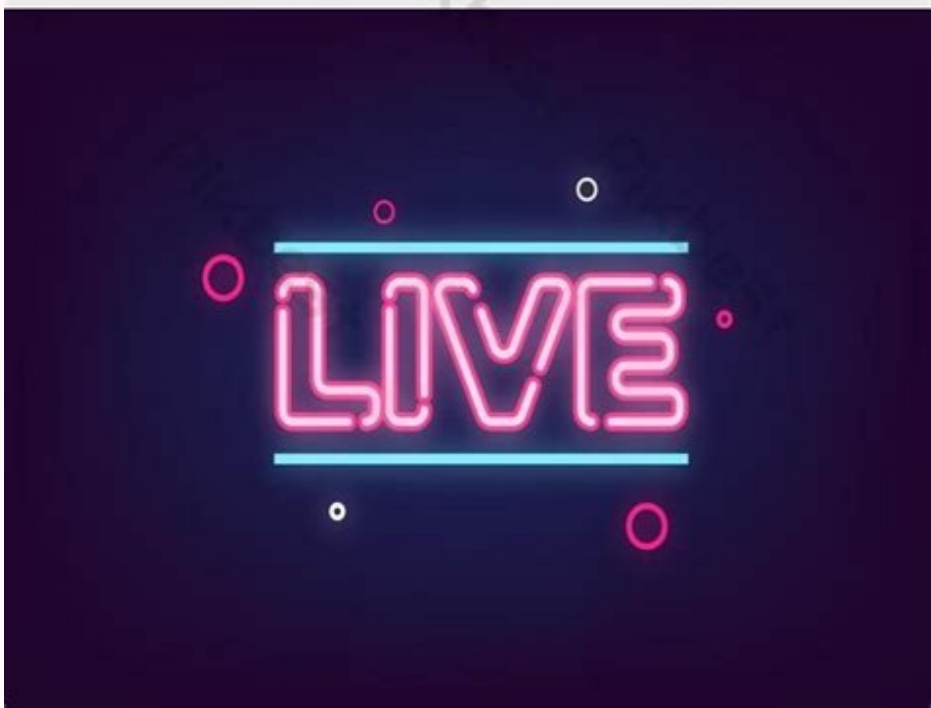
How to download video from shahid vip.